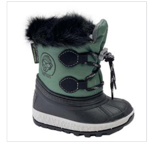
Forest - 01