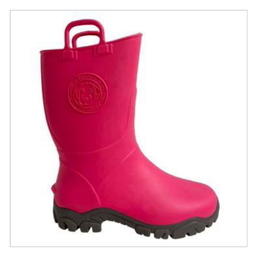
Fuchsia/Grey - 03