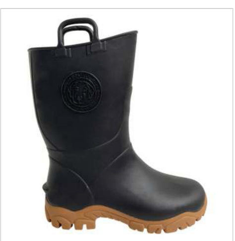
Navy/Brown - 05