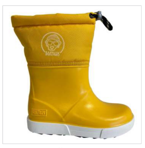
Fuchsia - 03 Navy - 01 Yellow - 02