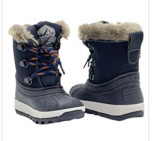
Navy - 02