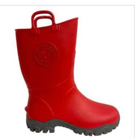
Red/Grey - 02