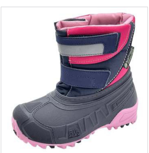
Pink/Navy - 02