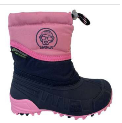
Pink/Navy - 02