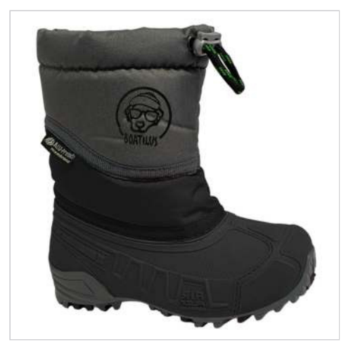
Black/Grey - 03