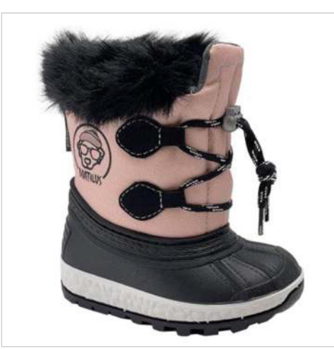
Old Pink - 02